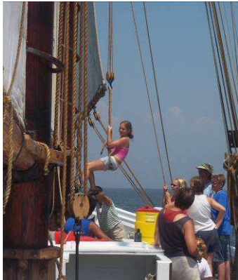
Mechanical advantage at work!

The Bayshore Discovery Project was presented the Sea Education Program of the Year award in November 2005 by the American Sail Training Association for its education programs on the A.J. MEERWALD.