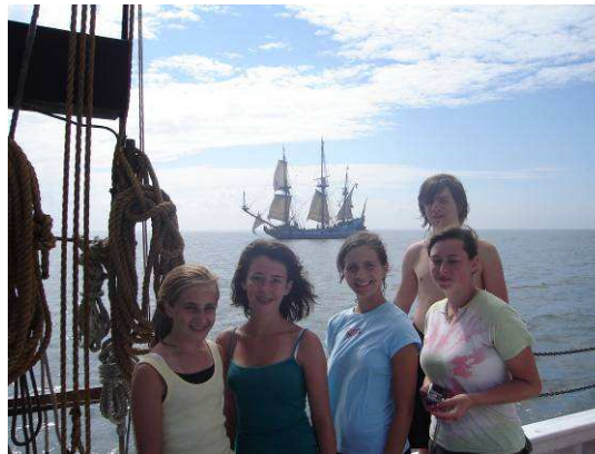
Crossing a tall ship!