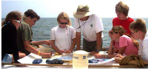
Working together to chart the ship's course.