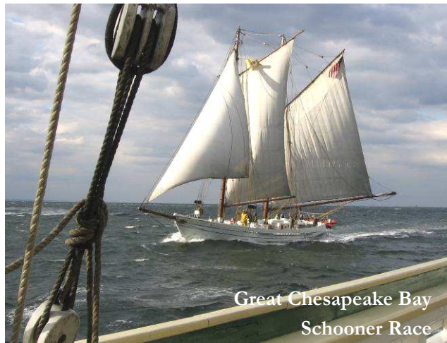
Great Chesapeake Bay Schooner Race